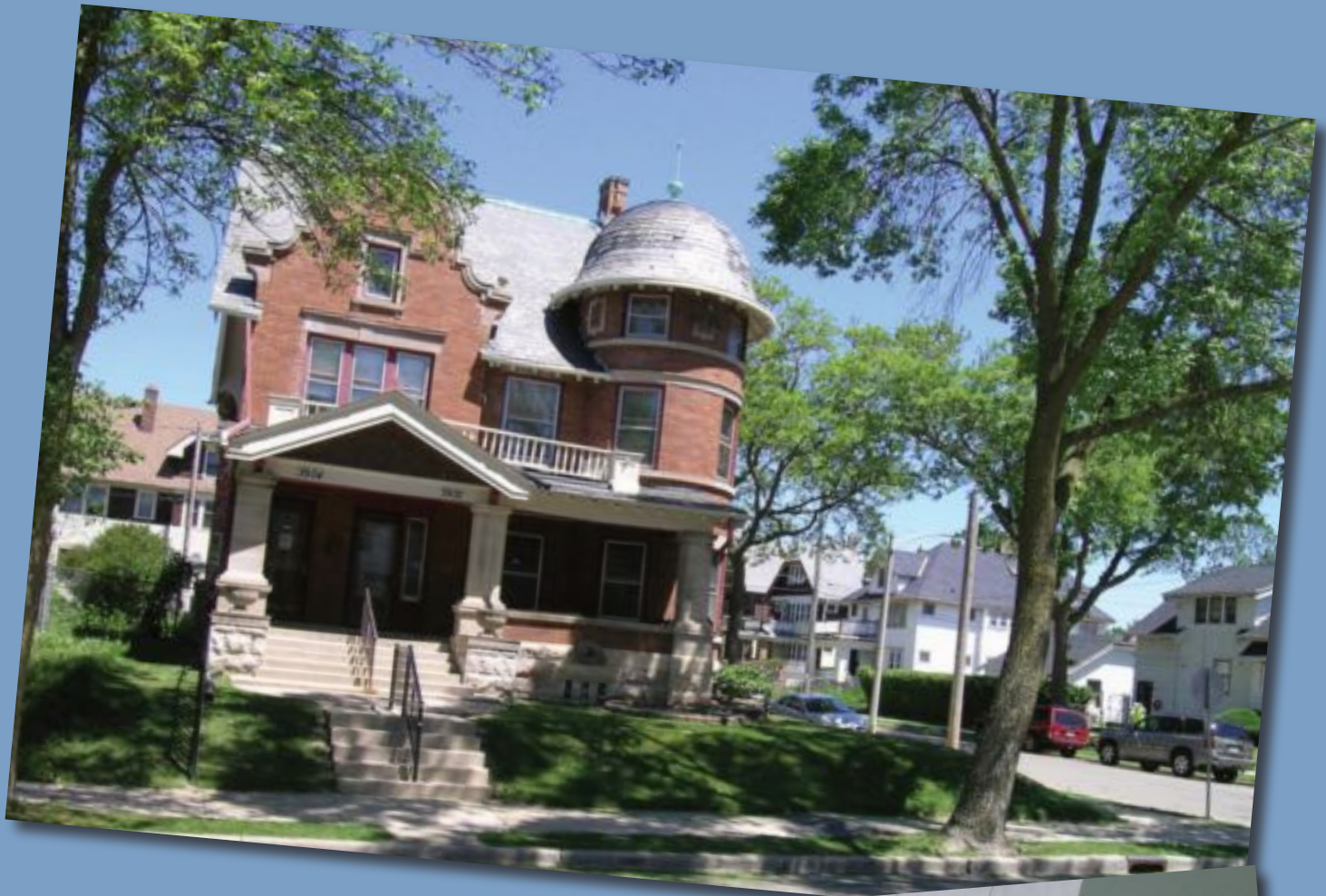
Today's neighborhood- House at 39th & Roberts