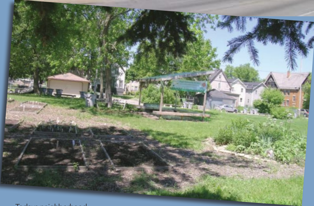
Today's neighborhood- Community Garden at 35th St.