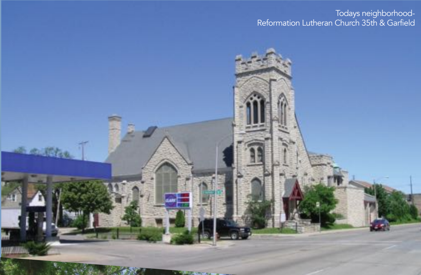
Today's neighborhood- Reformation Lutheran Church 35th & Garfield