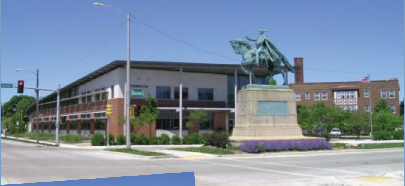
Today's neighborhood-Washington Park Library