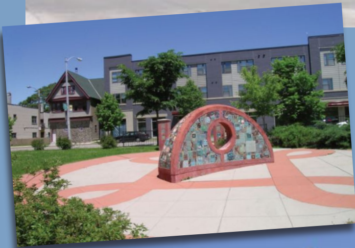
Today's neighborhood- Public art at 39th & Lisbon