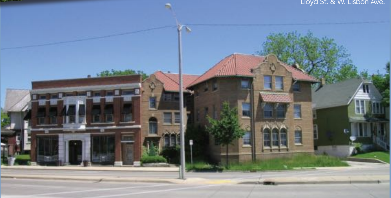
Today's neighborhood- Lloyd St. & W. Lisbon Ave.