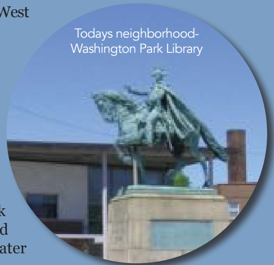
Today's neighborhood- Washington Park Library

By 1900, the City of Milwaukee had annexed the region to the far side of the park, and West Park was renamed Washington Park, reflecting the patriotic sentiment of the times. In harmony with its German population, 30 different German-American cultural societies donated the monument of playwright Johann Wolfgang von Goethe and poet Johann Christoph Friedrich von Schiller to the park in 1908. When World War I generated a backlash against Germans in Milwaukee, the Muehlenberg unit of the Von Steuben Society donated the statue of Frederick Wilhelm von Steuben to the park as a symbol of German loyalty to America. Von Steuben had served as inspector general and major general in the Revolutionary War under