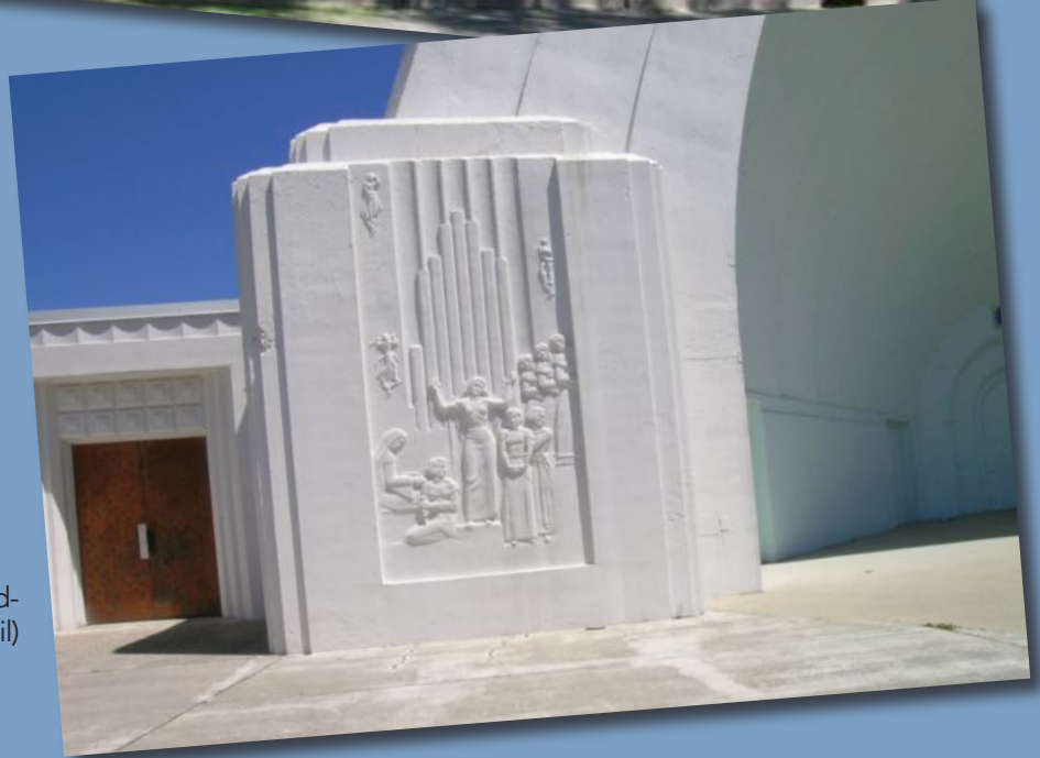
Today's neighborhood- Washington Park band shell (detail)