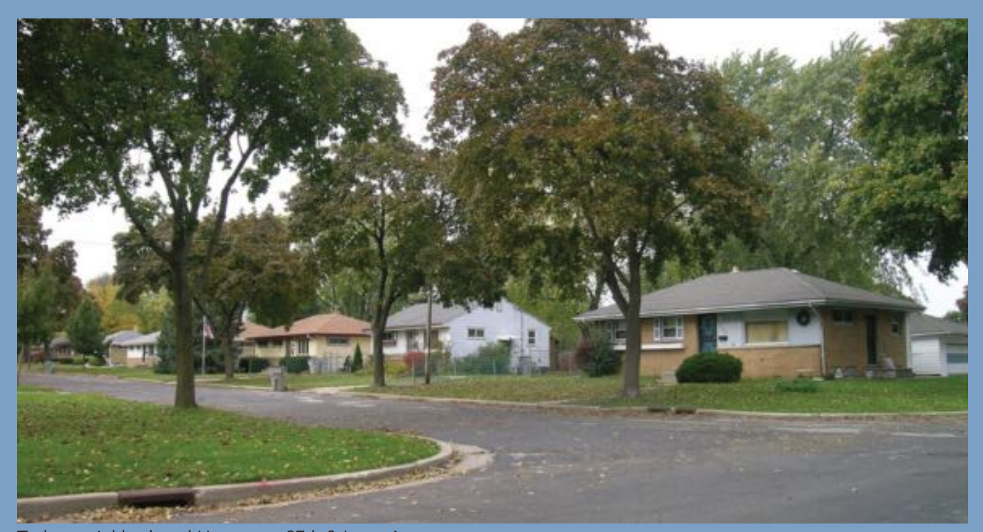
Todays neighborhood-Houses on 87th & Lawn Ave.