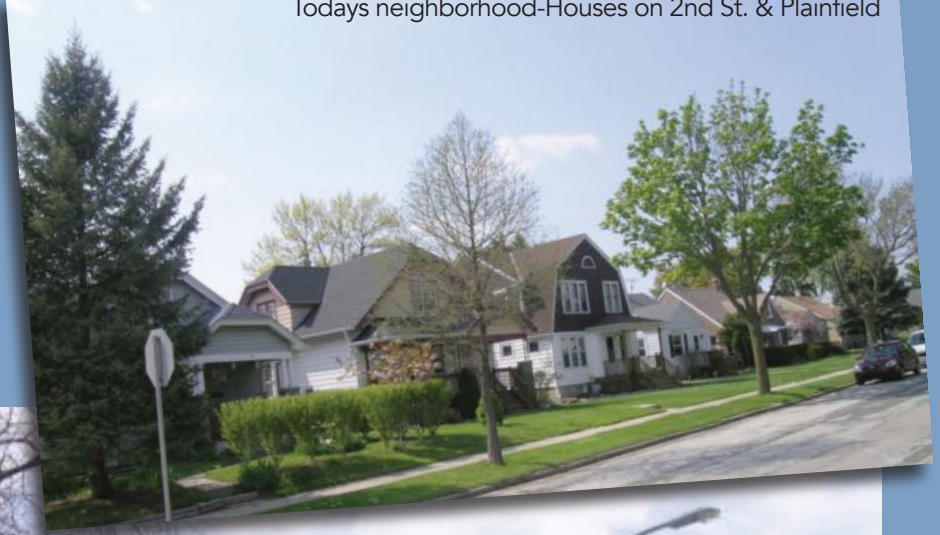
Today's neighborhood-Houses on 2nd St. & Plainfield