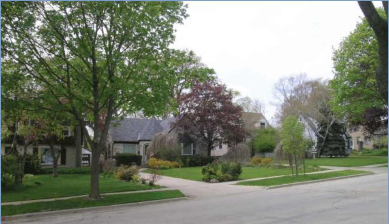
Today's neighborhood-Houses on Cudahy Ave.