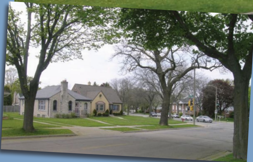
Today's neighborhood-Houses near the intersection of Pine and Whitnall