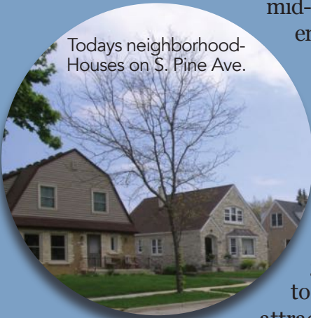
Today's neighborhood- Houses on S. Pine Ave.

Housing was reaching the far south side in the early 20th century. However, by 1926 there were only three completely paved roads in or approaching today's Town of Lake neighborhood—Howell, Whitnall, and Clement. Most of the area was occupied by farms and greenhouses. It wasn't until the end of World War II that the housing market really began to boom and new and improved streets emerged. Newly arriving settlers were migrating from Near South Side and Historic South Side neighborhoods.