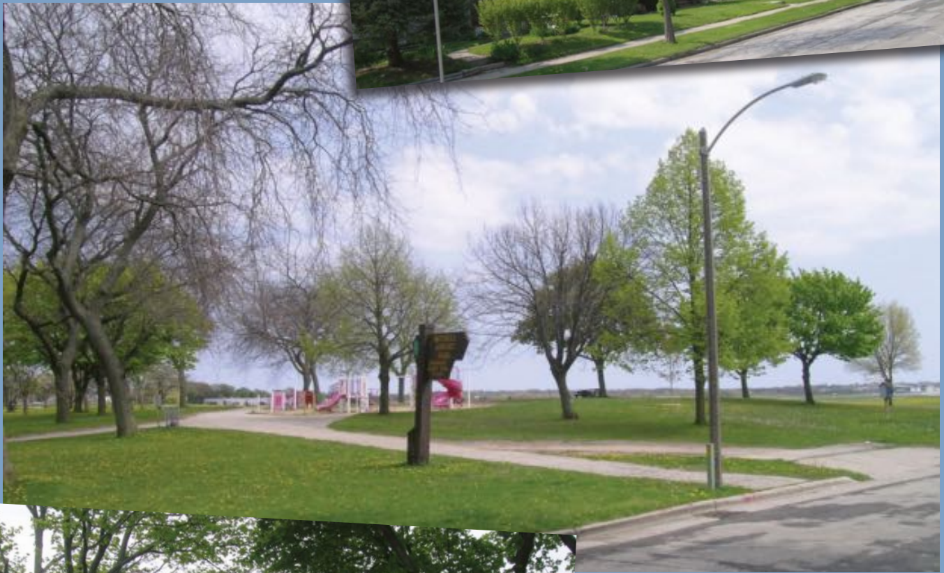
Today's neighborhood-Mitchell Airport Park