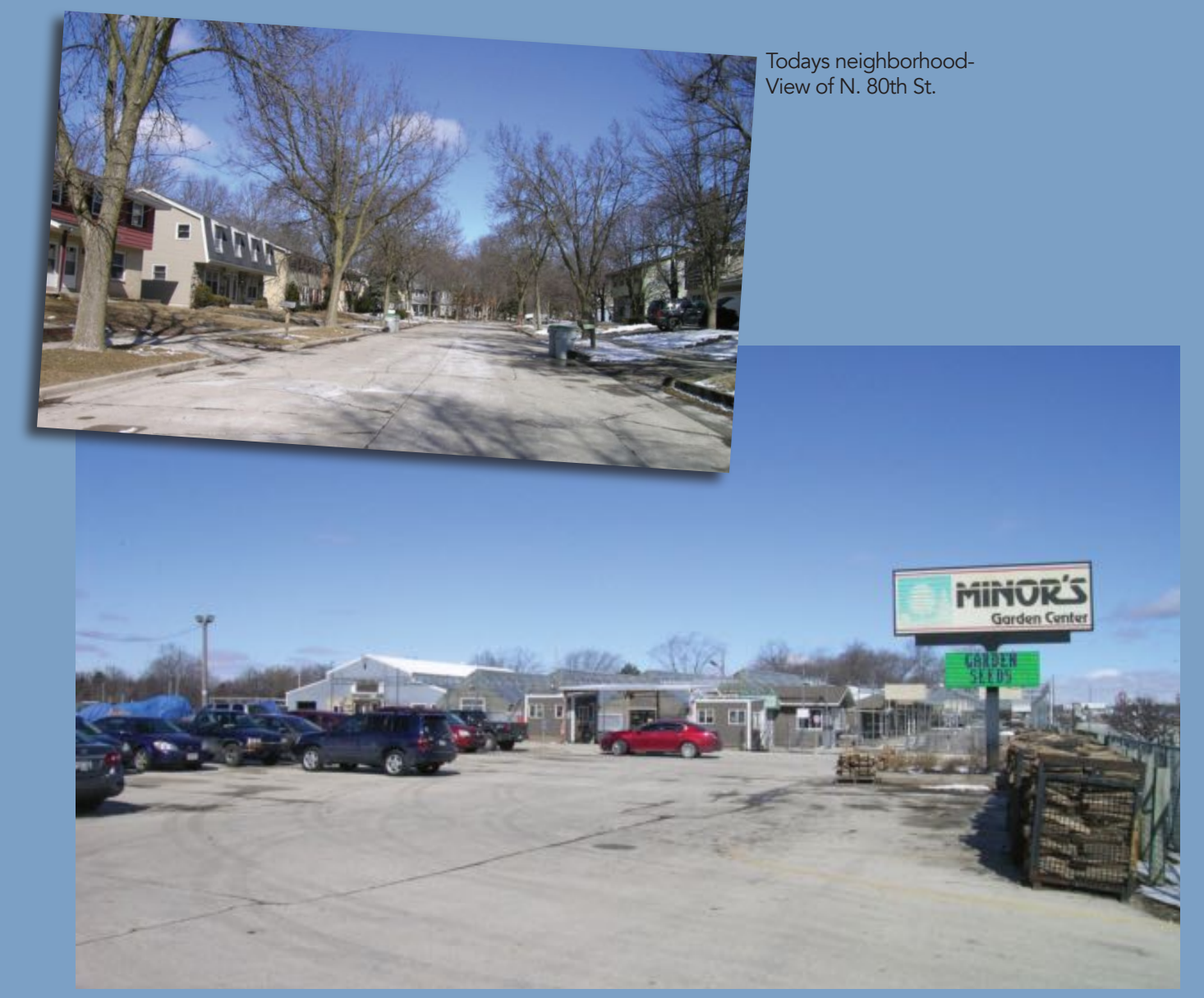
Todays neighborhood-Minor's Garden Center