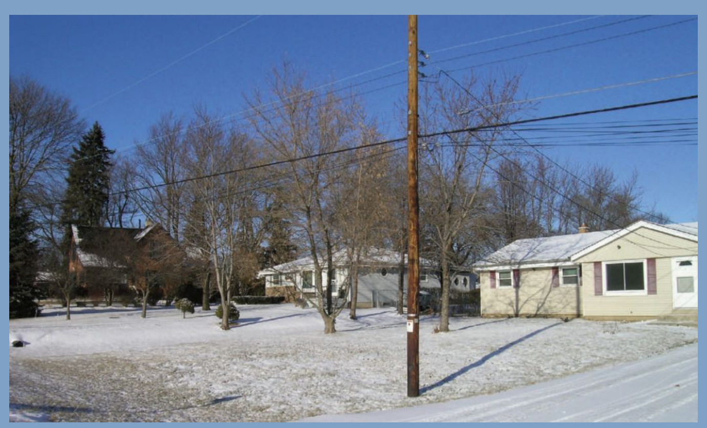
Todays neighborhood-Houses on W. Appleton Ave.