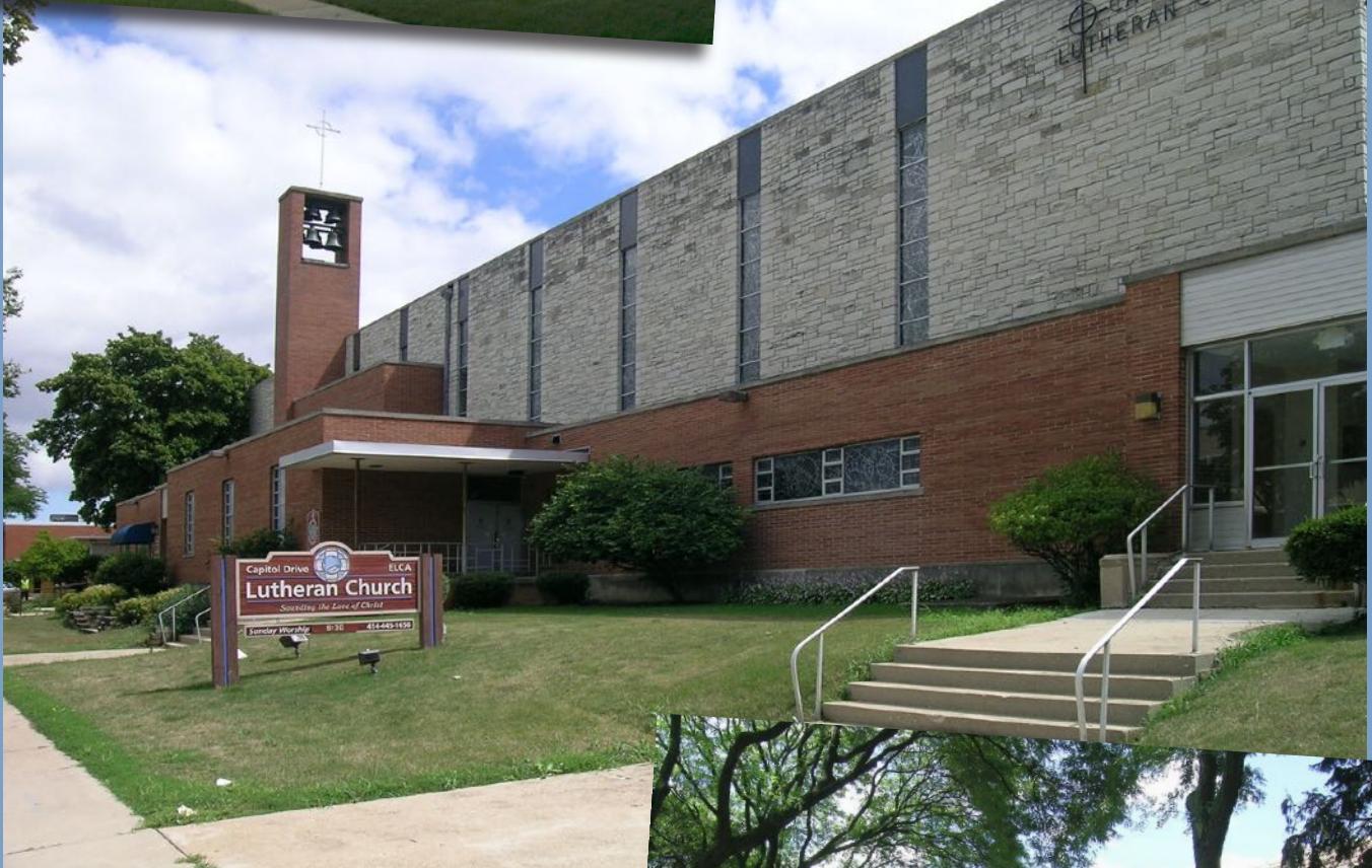
Today's neighborhood- Capitol Drive Lutheran Church