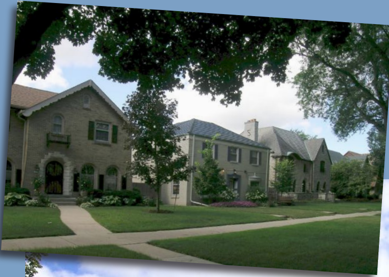
Today's neighborhood- 51st Blvd. with two story brick and stone Tudor style houses (1)