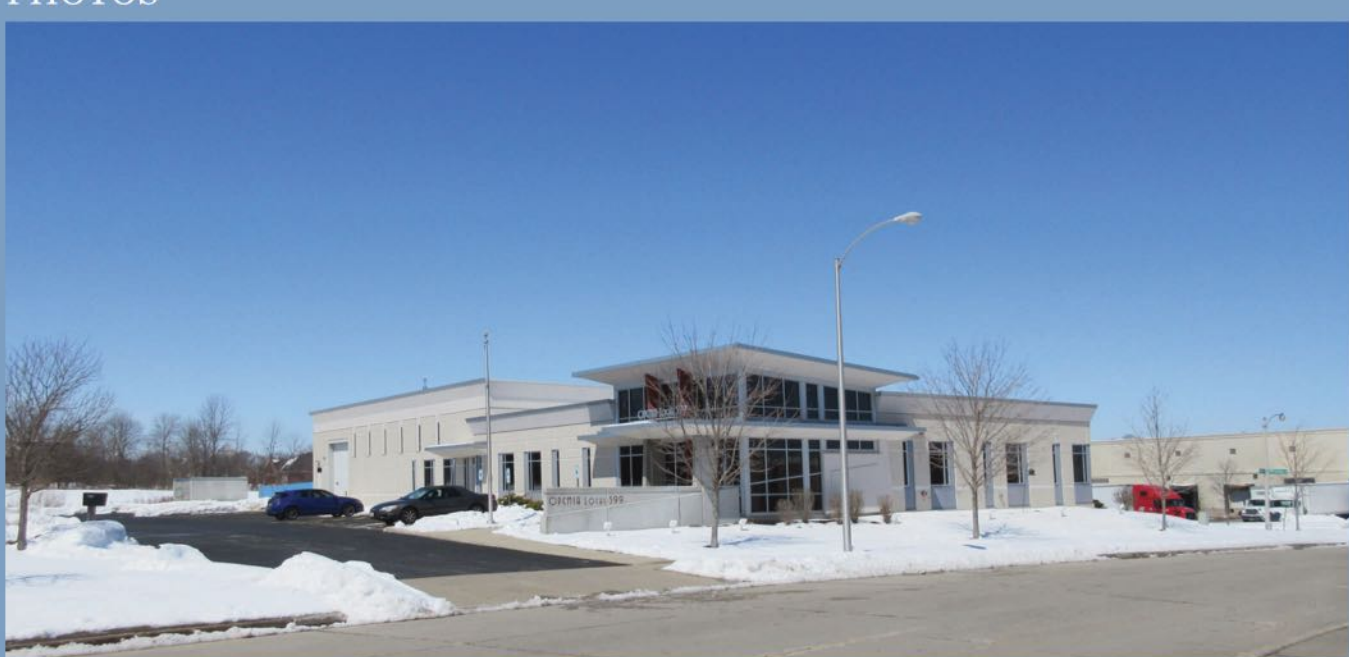
Todays neighborhood-N. Lauer St. & W. Brittany Way